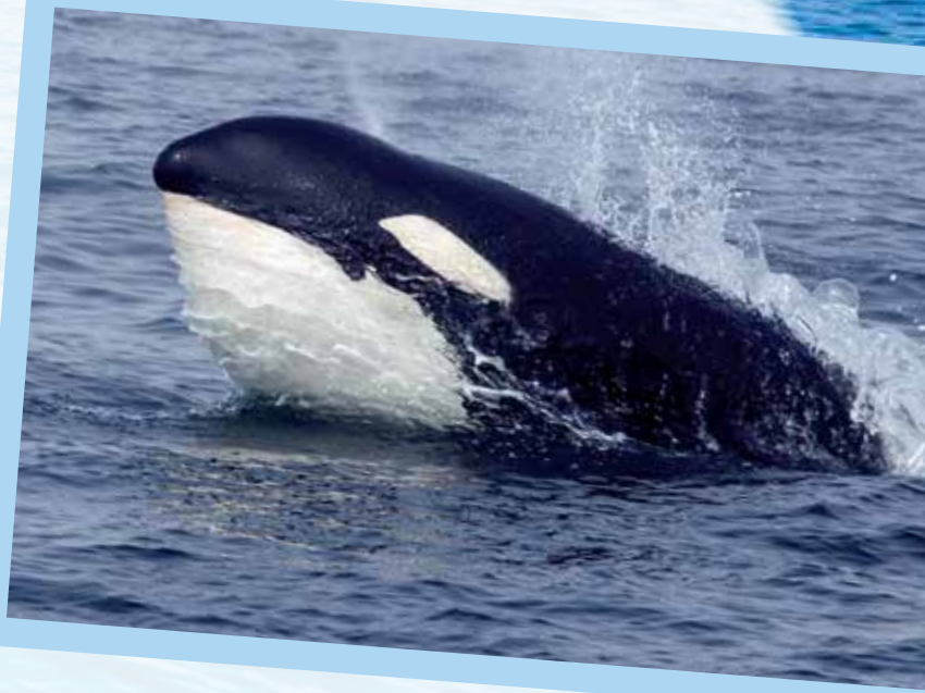
Eba helps scientists study the orcas in the waters near Washington, where she lives.